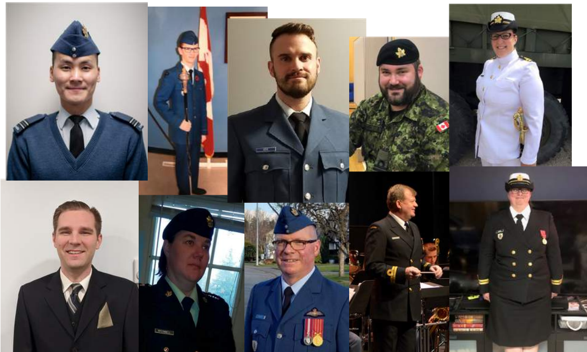
Pictured left to right, starting on the top row, as named.