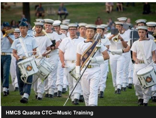
HMCS Quadra CTC—Music Training

Cadets have the opportunity to gain Sail Coach qualifications through a combination of CTC sail training, sail centre engagement and coach training clinics offered at the Regional level.